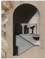
File Name: IAM_Kavin Mehta_03

Untitled by Kavin Mehta Stone and Natural indigo