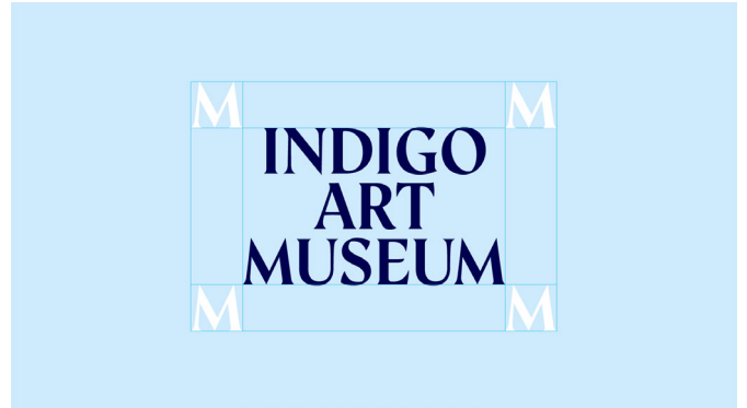
Logo clearspace guide