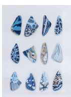
File Name: IAM_Nibha Sikander_02

'Nature construct -deconstruct' by Nibha Sikander Paper and Natural indigo