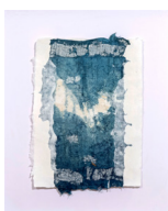
File Name: IAM_Priya Ravish Mehra_01

Untitled by Priya Ravish Mehra Paper pulp, Fabric and Natural indigo