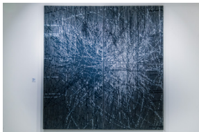
File Name: IAM_Manish Nai_02

Untitled by Manish Nai Aluminium and Natural indigo