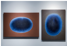
File Name: IAM_Alwar Balasubramaniam_01

'Skyground' by Alicja Kwade Stone, Felt and Natural indigo