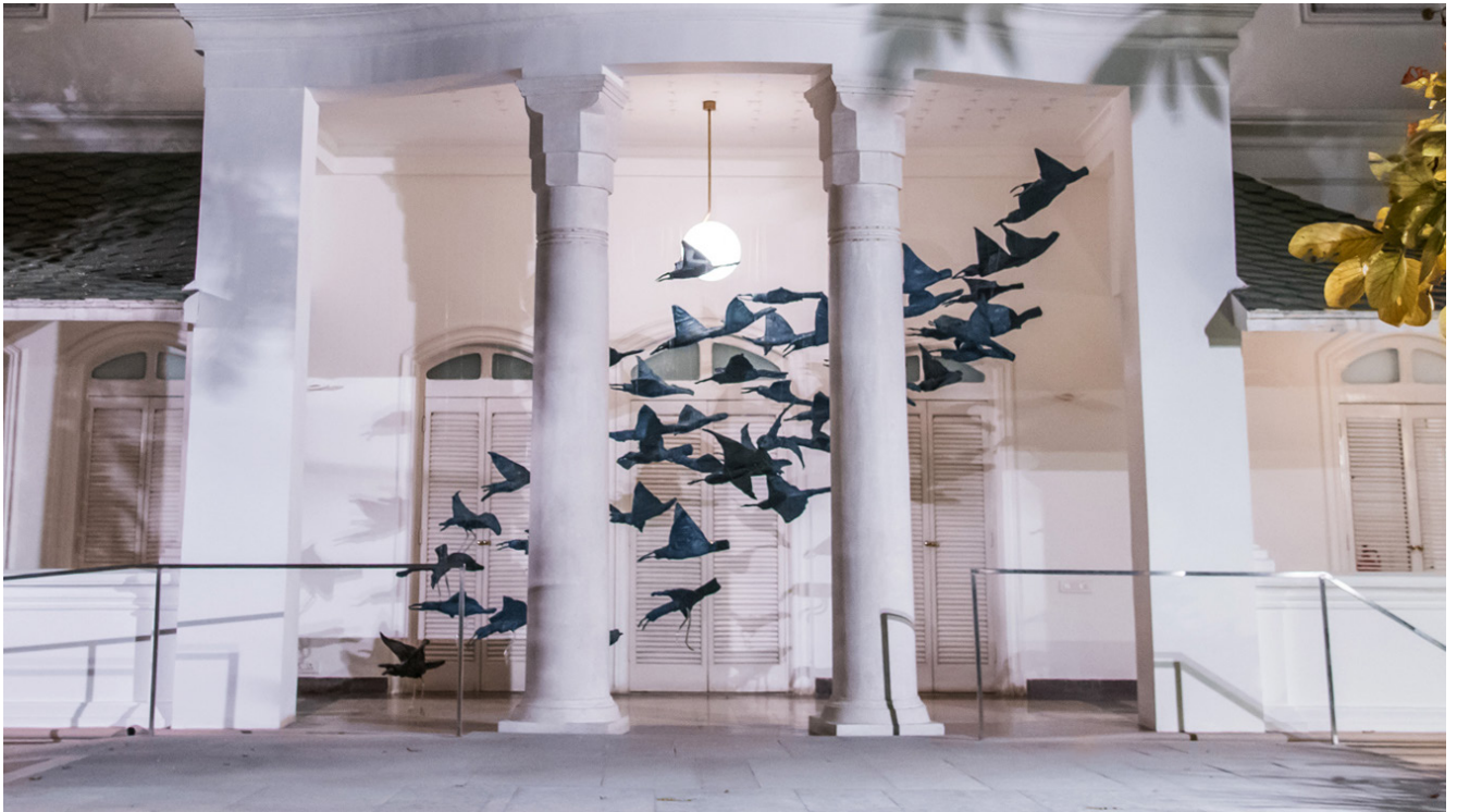
© 2024 Indigo Art Museum, Amit Ambalal's 'Birds of a Feather Flock Together' displayed at the Lalbaug Estate, Ahmedabad

This captivating artwork highlights the versatility of indigo. By combining dyed fabric with wire mesh and resin, the artist creates a dynamic interplay of texture and colour, showcasing a refreshing approach to using this ancient dye. In talking about this artwork, the artist says, “I have a special fascination for crows. Mainly because of their intellect and sharp alert movements. Collectively they are sometimes aggressive and act as performers.” The artist melds his experiences of working with indigo and his encounters with crows in this artwork.