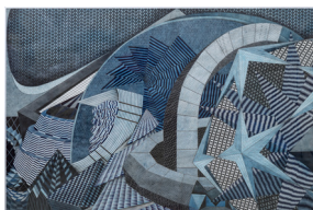
File Name: IAM_Bhagyashree Suthar_01

'Birds of a feather flock together' by Amit Ambalal Wire mesh, Fabric, Resin and Natural indigo