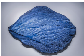
File Name: IAM_Alwar Balasubramaniam_02

Untitled by Alwar Balasubramaniam Natural indigo pigments and Earth on Canvas