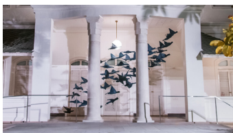
File Name: IAM_Amit Ambalal_01

'Earth' by Alwar Balasubramaniam Resin, Paint and Natural indigo